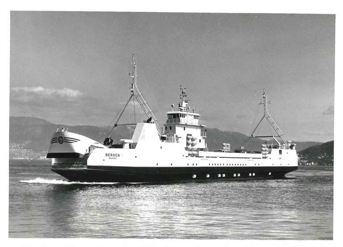
The Ferry "Bergen" crossing Byfjorden on its way from Bergen-Nøstet; to Kleppestø, 1984.